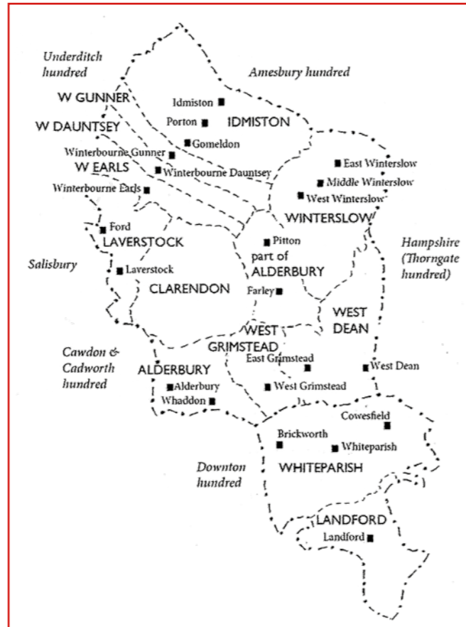
Above: The areas to be covered by volume 21.

Gift aid, which is available if you pay income tax and the donation is not made from a charitable trust, is valuable both to us (allowing us to claim back the tax you have paid) and to you (by offsetting your liability to higher rate tax). The fourth section of the form is a gift aid declaration.