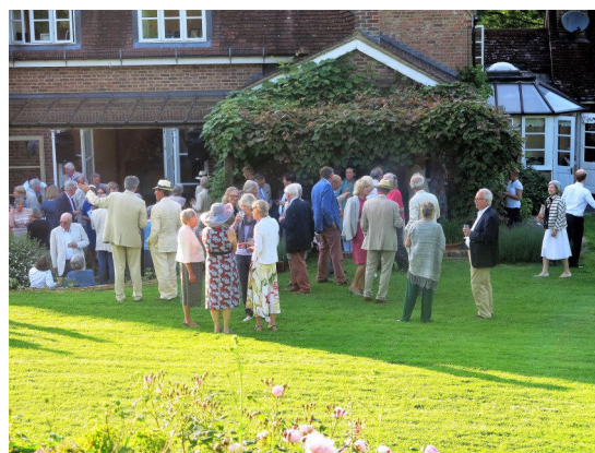
Friends and supporters enjoying the evening sun as guests of The Countess of Inchcape at Manor Farm, Clyffe Pypard.