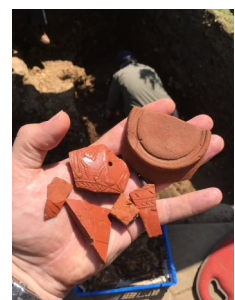
Roman finds in Marc Allum's Chippenham garden