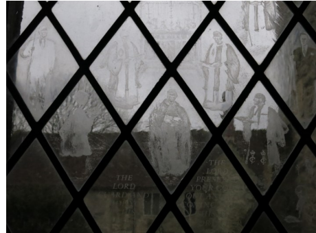
Detail from an engraved window in St Michael's Church, Mere, depicting the local clergy of the time, with the Bishop of Ramsbury in the centre.