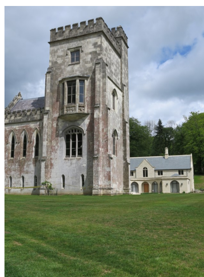
The remains of Beckford's Old Fonthill Abbey, built in 1796 with its 21st century extension in the background.

https://www.wiltshiremuseum.org.uk/?event=online-talk-the-houses-of-fonthill-lost-recovered-rebuilt&event_date=2023-05-17